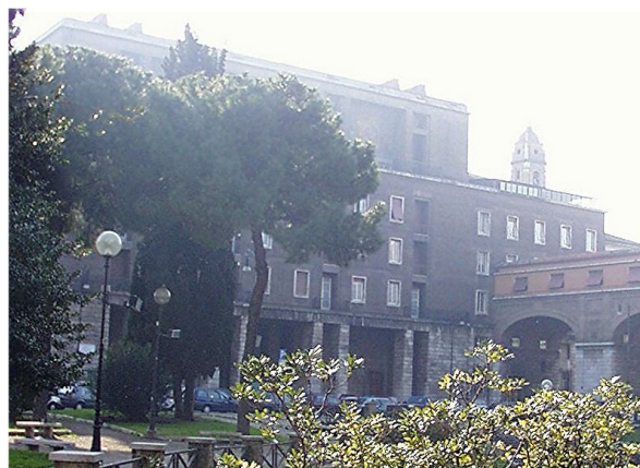
Figure 12. View of the Collegio degli Illirici.