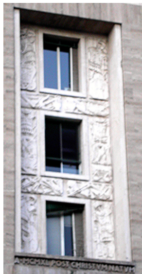
Figure 4. Western tableau window from National Social Security Administration Building.