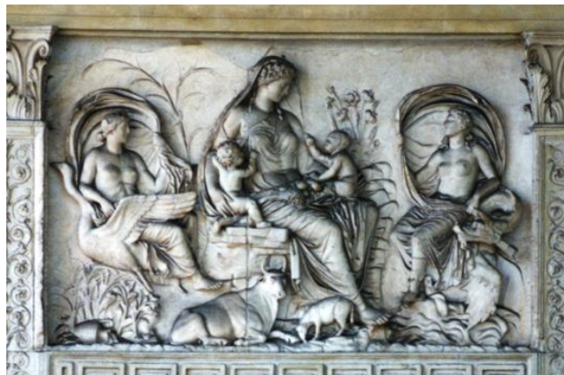
Figure 11. Tellus panel from the Ara Pacis.