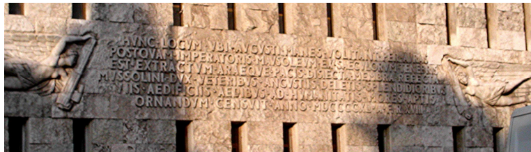
Figure 7. Latin inscription from National Social Security Administration Building.