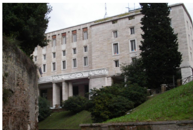
Figure 8. View of the eastern building for the National Social Security Administration.