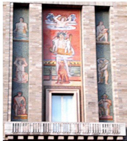
Figure 6. Mosaic triptych from National Social Security Administration Building.