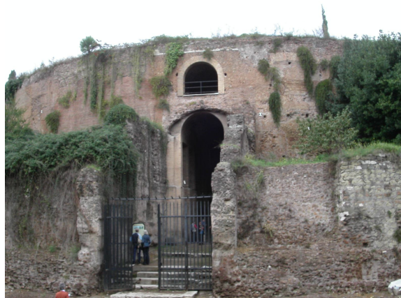
Figure 1. Exterior View of the Mausoleum of Augustus.