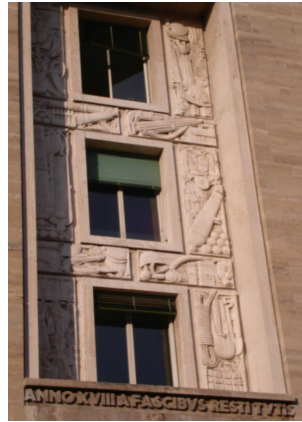
Figure 5. Eastern tableau window from National Social Security Administration Building.