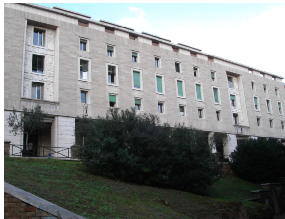
Figure 3. View of National Social Security Administration Building.