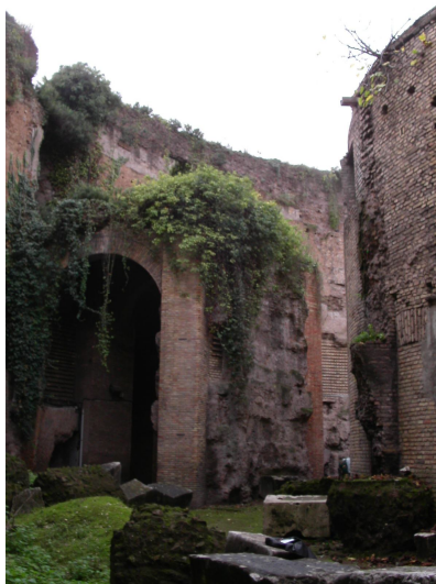
Figure 2. Interior view of the Mausoleum of Augustus.