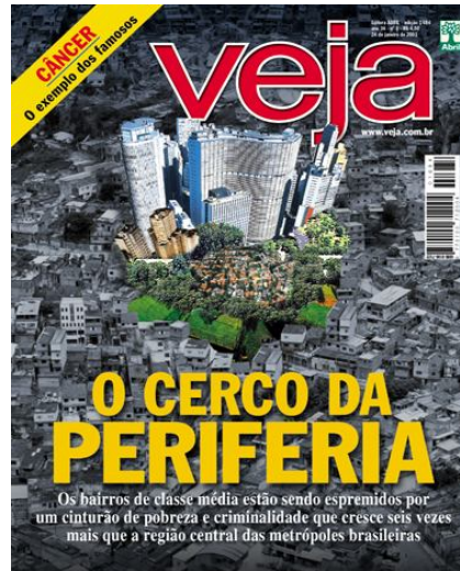
Figure 2 – Veja Magazine's cover

Weekly magazine Veja (24/01/2001). The cover says: “The periphery encircle. Middle class neighbourhoods have been squeezed by a belt of poverty and criminality that grows six times more than the inner cities in Brazilian metropolis”