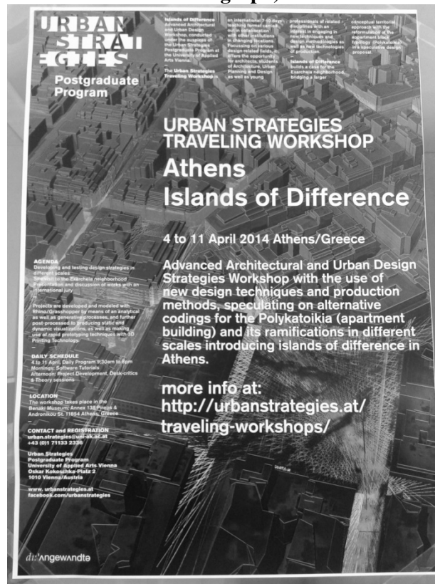
Figure 2: New Taxonomies for the Mediterranean City: Athens as 'Islands of Difference'

While being morphologically different from the 'global city-regions' described by the Anglophone literature (e.g. Tumpel-Gugerell and Mooslechner 2003), the Mediterranean protagonists of immature polycentric models are promising references for future studies on southern urban development. How the Mediterranean cities are part of this new debate and how their urban regions comply with the current urban trends in 'northern' countries have been the subjects of recent studies. Convergence or divergence, adaptation or resilience, are the new trends to be investigated from various points of view (Longhi and Musolesi 2007). Questions on the future of the Mediterranean cities are still open, scenarios on the development of their urban regions in view of the global market are still fluid. Architectural landmarks, cultural events, shared planning practices contribute only partly to answer these complex questions.