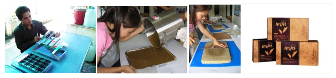
Figure 10: Wat Chan Patana Maid Group

Ekarat golden jewelry is in Tambon ta Chai Amphor Sri-Suchanarai Sukho-Thai. The products are gold and silver accessory with gem in Thai modern style.