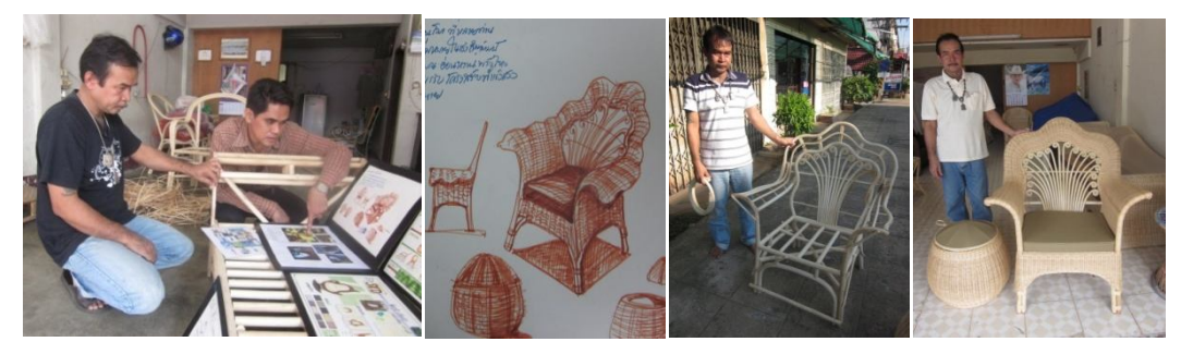
Figure5: Tinakorn Rattan Palm Furniture

This community is in Tambol Sri-pilomAmphor Prom- piramPhitsanulokProvince. The local products are Ropebasket and furniture. The table and chair use steel line as the structure of the furnitureand wired by rope . This furniture set are composed of 4 seats and table.