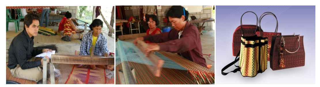
Figure6: Papirus Grass Product

Tambon Hua-roaAmphorMuangPhitsanulokProvince. The products are rattan palm furniture; chair and stule.