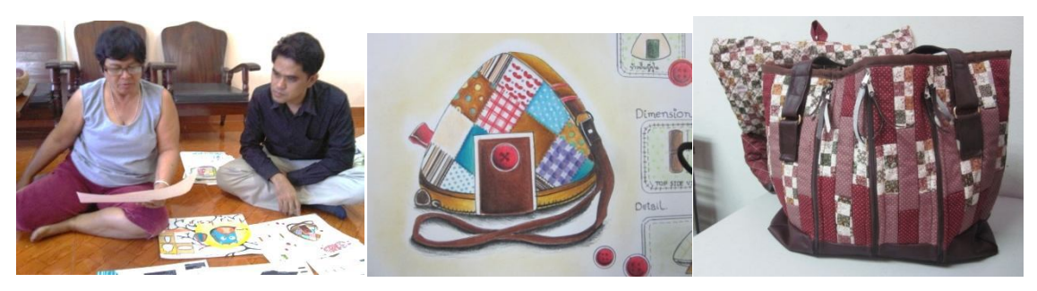
Figure7: Ta Thong Handicraft & Quilt

This group is in Tambol Ta thongAmphorMuangPhitsanulokProvince. The products are purse and bags use quilt technique.