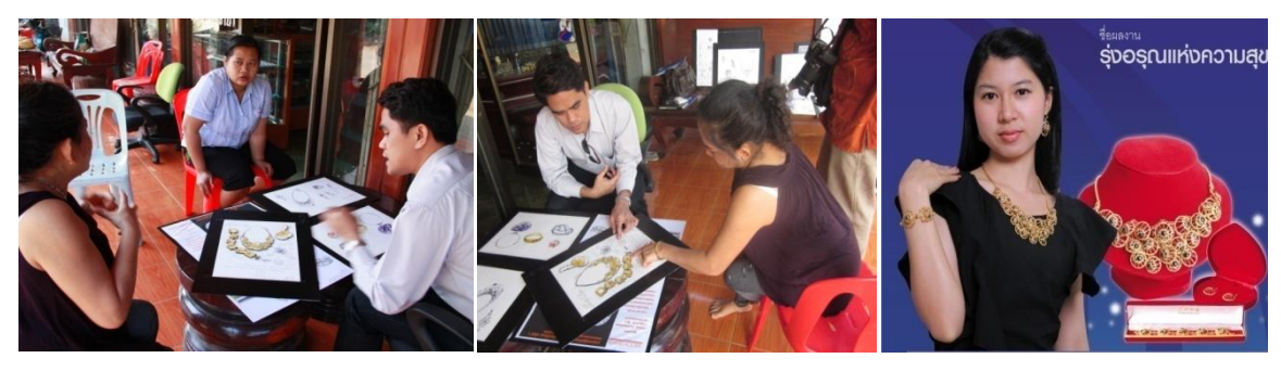
Figure 9: Ekarat Golden Jewelry

This community group is in Municipal of Sri Panom Mas AmphorLubLaeUtradit Province. The products are made by artificial silk such as hand bag, lady suit and dolls