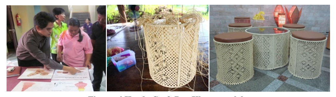
Figure :4 Handy Craft Ban Klong-maplab

This community is in TambolAran-yikAmphorMuangPhitsanulokProvince . The local product are Thai houses teak wood model, single Thai house and group houses in Thai style architecture. The products developed as souvenir for tourism promotion and Thai architecture wisdom.